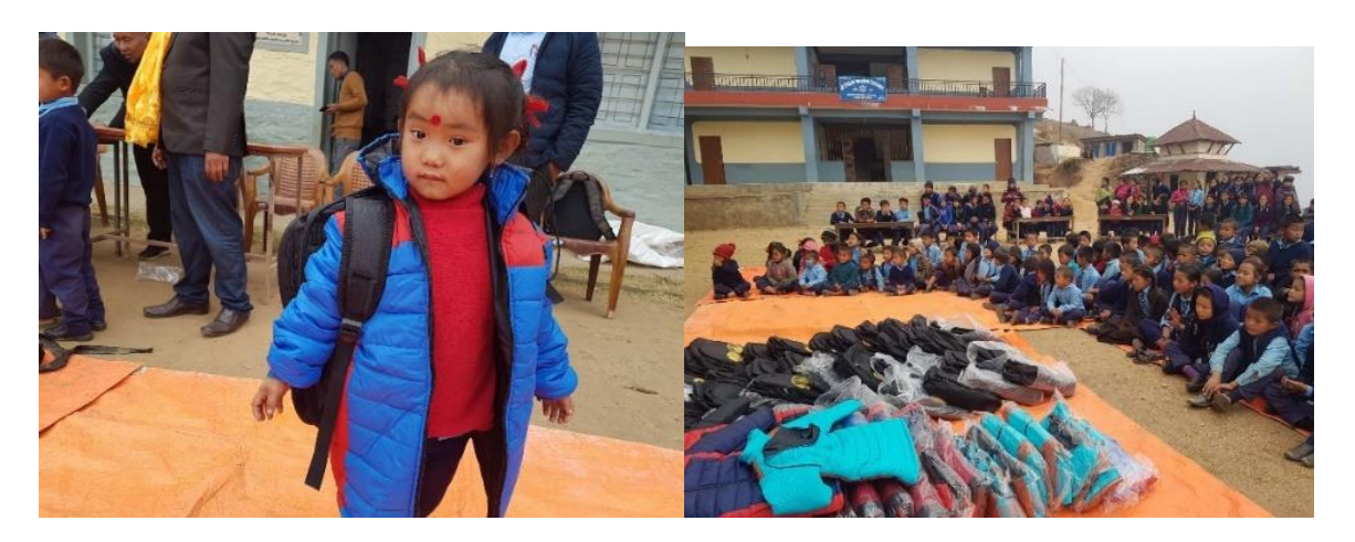
Library Book Bag with Children Story Books Support

1. Supported winter jacket to the children of Shree Himalaya Secondary School, Lamjung on 26 February 2021. These children are from low economic background. Total 50 children were benefited from this support.